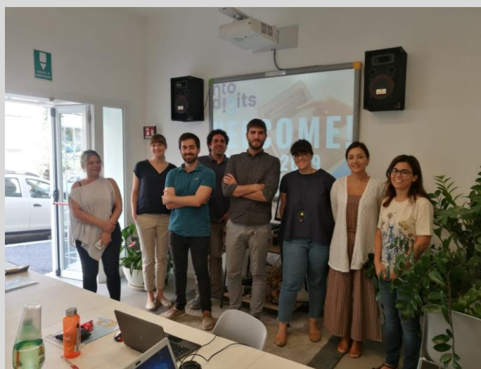
4 th Transnational Meeting in Rome, Italy